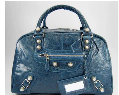
Original Quality Balenciaga Lambskin Handbags-Sapphire Blue