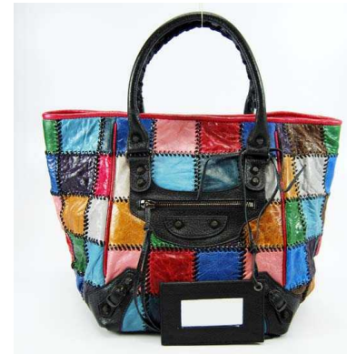
Original Quality Balenciaga Lambskin Handbags-Red