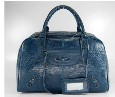
Original Quality Balenciaga Lambskin Handbags-Sapphire Blue