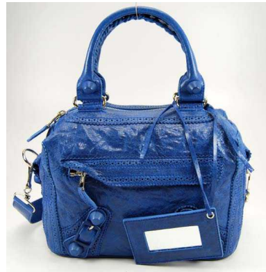
Original Quality Balenciaga Lambskin Handbags-Delftblue