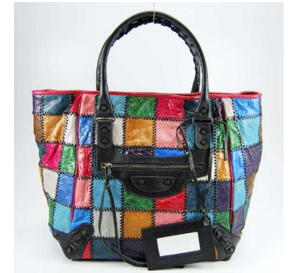
Original Quality Balenciaga Lambskin Handbags-Red