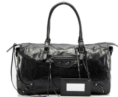
Original Quality Balenciaga Imported Leather Handbags-Black $1,169.00 $182.88 Save: 84% off