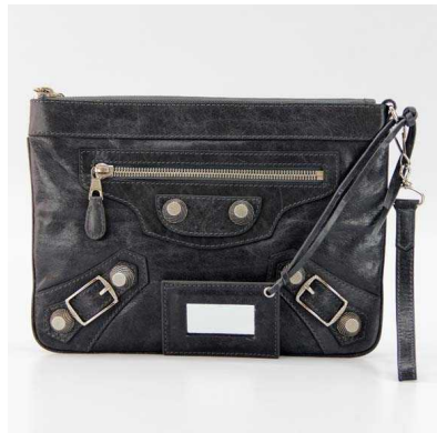
Original Quality Balenciaga Giant Silver Purse Imported Leather Bags-Gray $1,032.00 $145.88 Save: 86% off