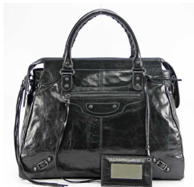
Original Quality Balenciaga Imported Leather Handbags-Black $1,198.00 $200.88 Save: 83% off