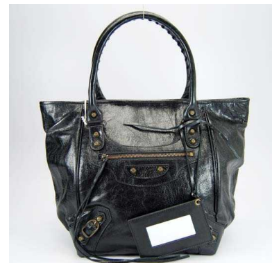
Original Quality Balenciaga Imported Leather Handbags-Black $1,124.00 $183.88 Save: 84% off