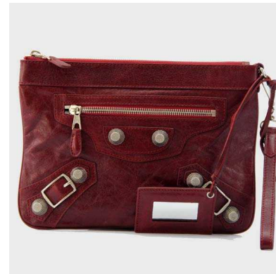
Original Quality Balenciaga Giant Silver Purse Imported Leather Bags-Red $1,038.00 $145.88 Save: 86% off