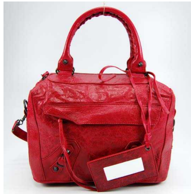
Original Quality Balenciaga Lambskin Handbags-Red