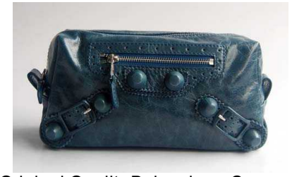
Original Quality Balenciaga Covered Giant Pencil Leather Bags-Sapphire Blue