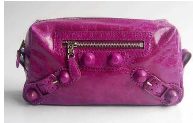
Original Quality Balenciaga Covered Giant Pencil Leather Bags-Medium Purple