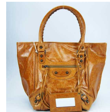
Original Quality Balenciaga Imported Leather Handbags-Camel $1,015.00 $183.88 Save: 82% off