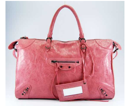
Original Quality Balenciaga Lambskin Handbags-Pink