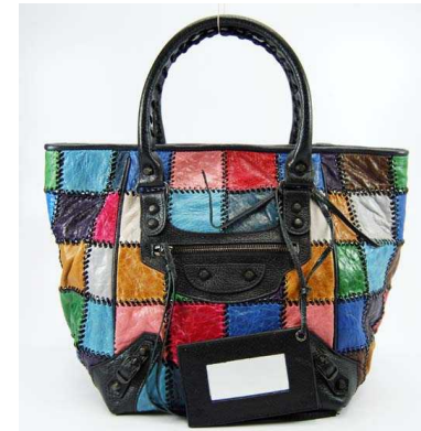
Original Quality Balenciaga Lambskin Handbags-Navy Blue