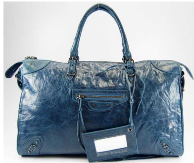
Original Quality Balenciaga Lambskin Handbags-Sapphire Blue