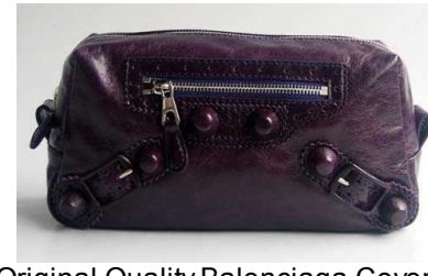
Original Quality Balenciaga Covered Giant Pencil Leather Bags-Purple