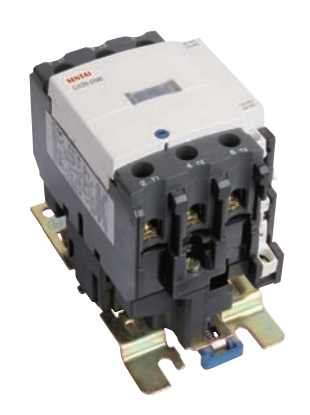
CJX2N 80, 95