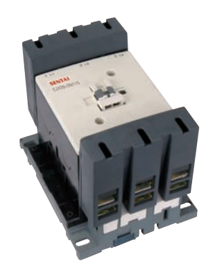
CJX2N 115, 150